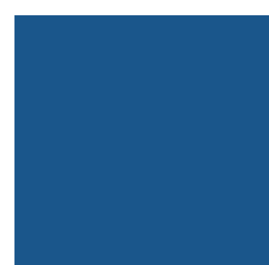
xal -DESIGN 18 4601A52433A10