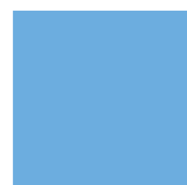
xal -DESIGN 17 4601A50240A10