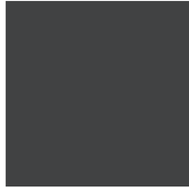
xal -TREND 3 4201E92246A3F