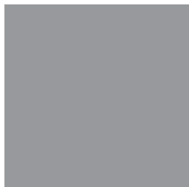
xal -CLASSIC 36 4201E75307A3F