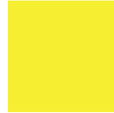
xal -DESIGN 11 4601A18930A10