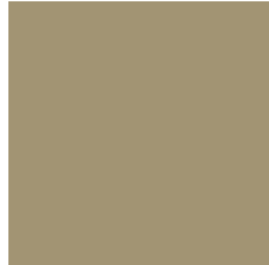
xal -CLASSIC 32 4201E82301A3F